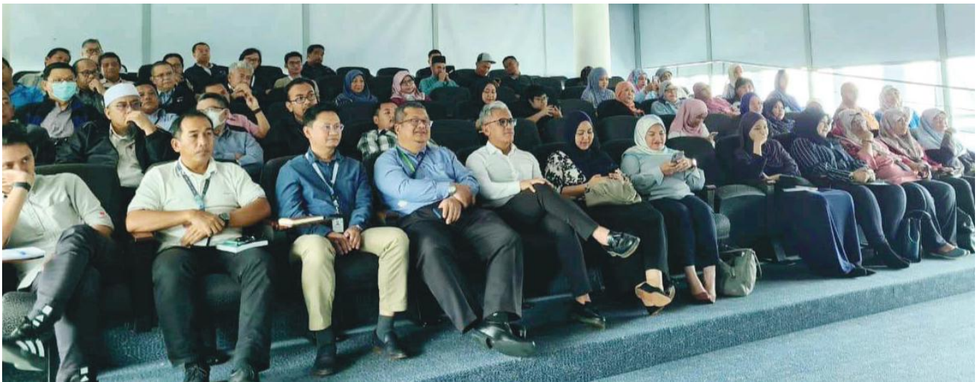
Officers and associates of the three DevCos attending the talk