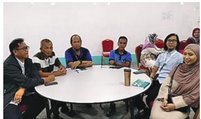
The bigger group comprising micro business participants