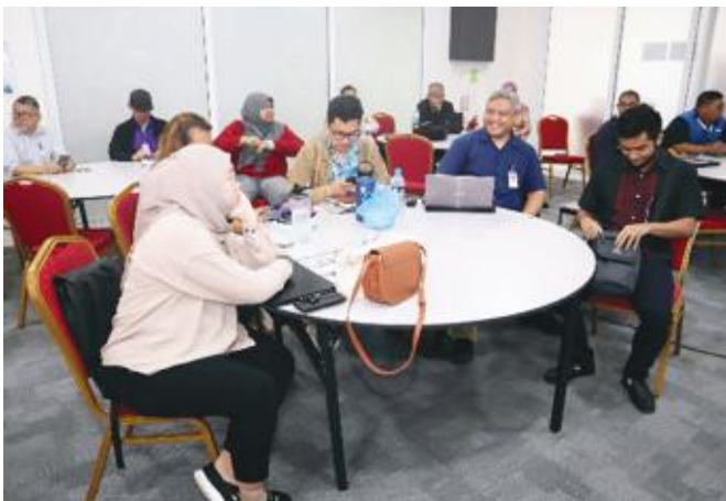
The digital and technopreneurs group